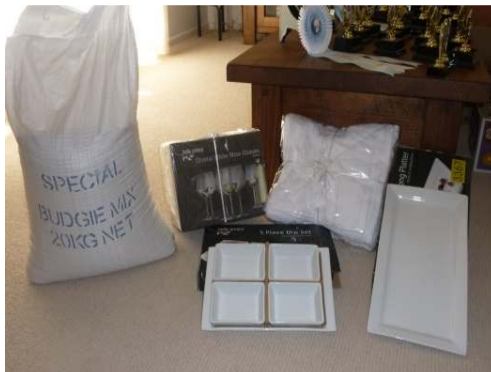
Raffle prizes your choice of prizes Bag of Seed, set glasses, set towels, rectangular platter, 5 piece platter set