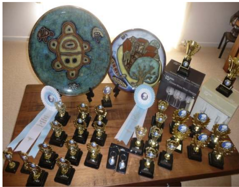
Some of the trophies for SCBA Annual Show