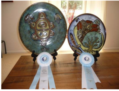
Grand Champion & Champion O/S of Show Trophies (painted plates)